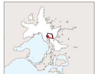
Part of Planning Scheme Map 13EAO