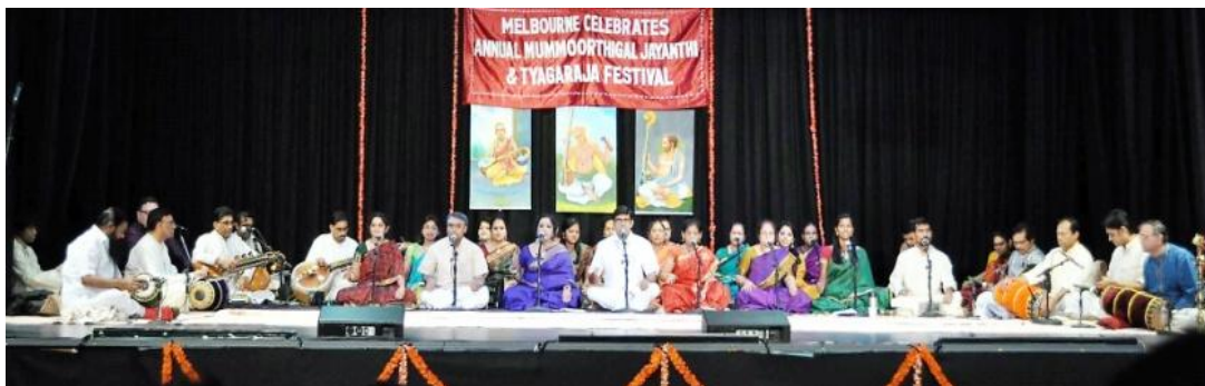
Pancharatna Krithis (2014)