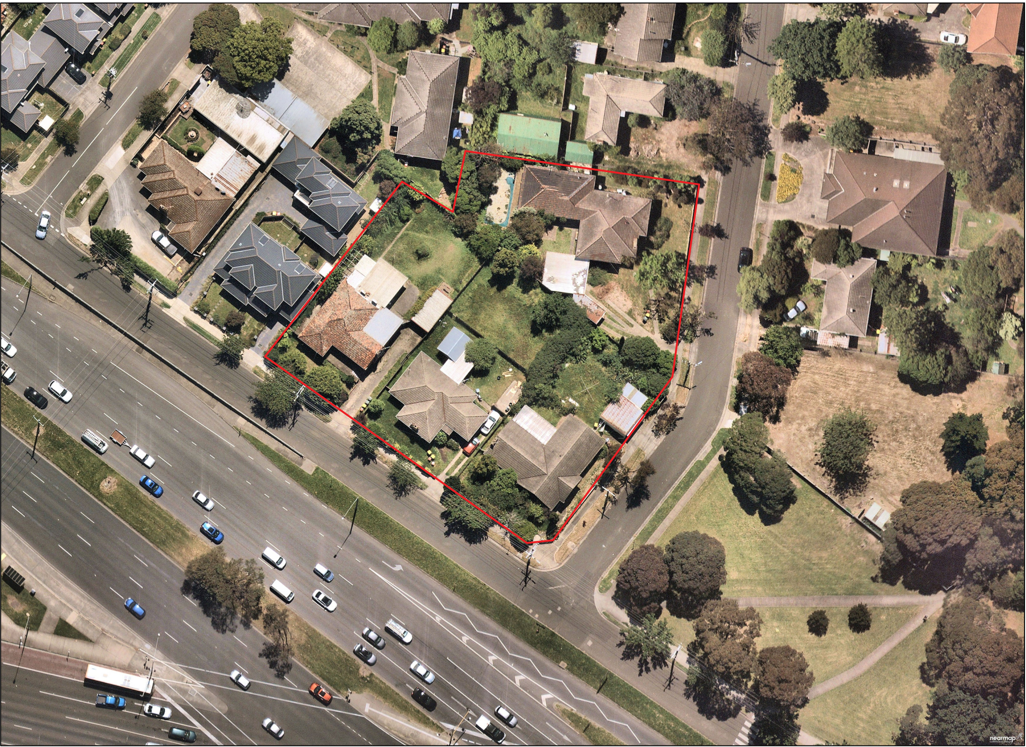
01 LOCATION PLAN - NOT TO SCALE