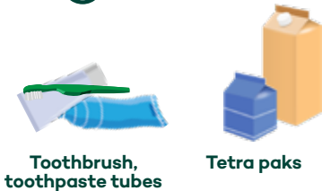
Toothbrush, toothpaste tubes