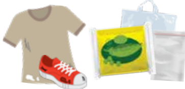
Old clothing, footwear*