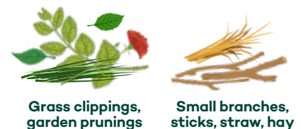
Grass clippings, garden prunings