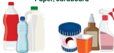
Plastic bottles (lids on)