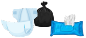
Nappies, baby wipes, pet waste, incontinence pads, sanitary items (wrapped)