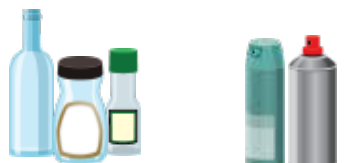
Glass bottles, jars (lids on)