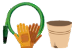
Gloves, plastic pot plants, garden hose