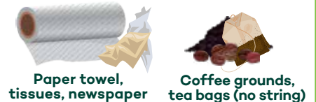
Paper towel, tissues, newspaper