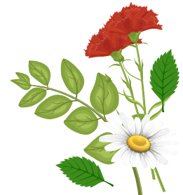
Flowers, plant leaves