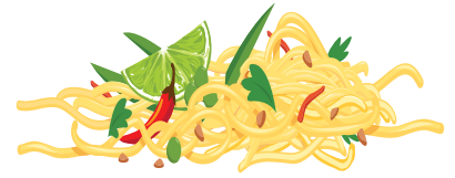
Noodles, pasta, rice, cooked leftovers