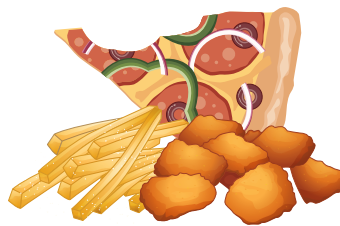
Takeaway foods, fried foods