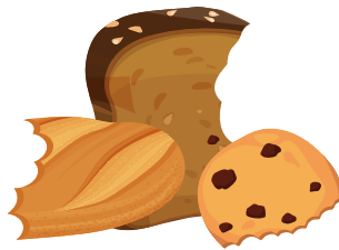
Baked goods, mouldy food