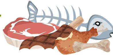
Meat, fish, seafood, bones (raw and cooked)