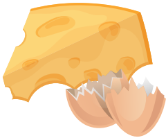
Cheese, dairy, eggshells