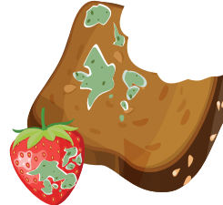
Mouldy, spoiled, out-of-date food