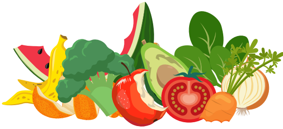
Fruit and vegetable peelings, scraps