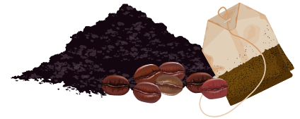
Coffee grounds, tea leaves, tea bags (no labels or staples)