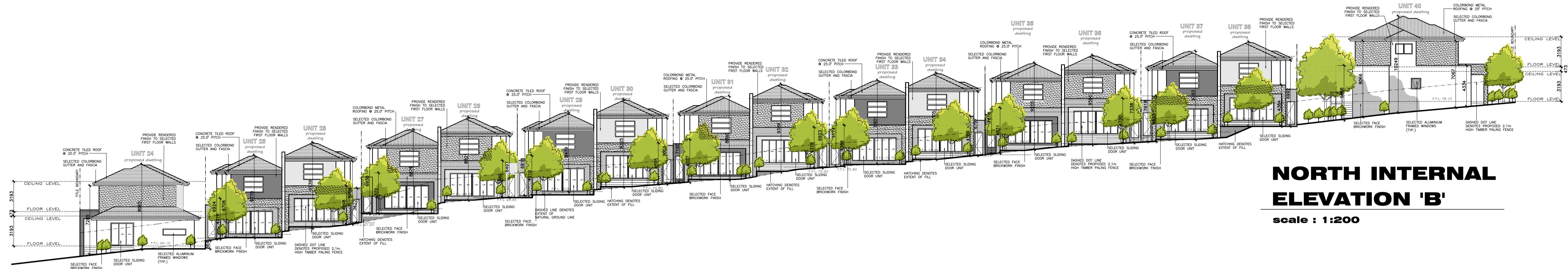
NORTH INTERNAL ELEVATION 'B' scale : 1:200

INTERNAL BOUNDARY FENCING TO BE A TIMBER PALING FENCE WITH A MINIMUM OF 2.1m IN HEIGHT